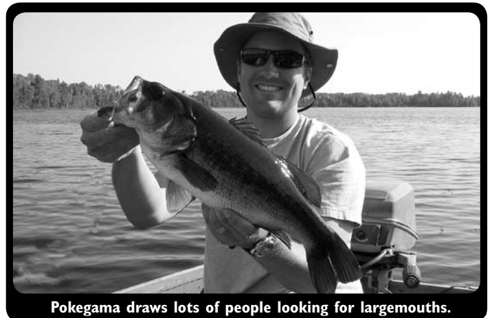
Pokegama draws lots of people looking for largemouths.

Pokegama Lake has a fairly good gravel boat ramp with toilets. It is on the south end of the lake and has parking for a couple dozen rigs.